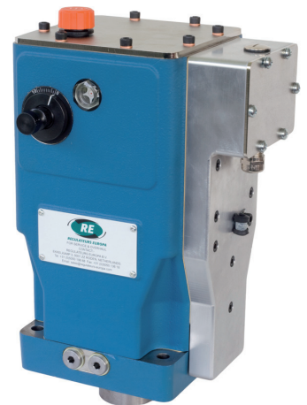
Hydraulic actuator 2800

RE's strength lies in its ability to provide comprehensive and cost effective governing, control and monitoring packages, with a full range of after sales support for applications ranging across the marine, industrial and rail traction markets.