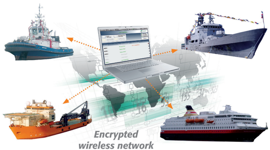
ReMACS – Remote Monitoring of Alarm & Control System for vessels at harbour

Data Process has already acted as HEINZMANN's Norwegian representative for many years, supplying this market with electronic speed governors as well as systems for power management and remote control of propulsion.